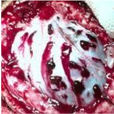
Figure 3: Multiple Dural-Stabs (5-8 mm) parallel to vessels causing gradual decompression of clot. Biomedical Research