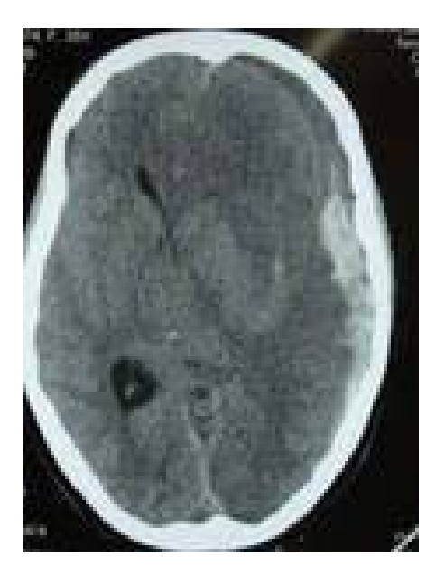
Figure 1: Plain CT Scan Brain shows Acute subdural hematoma with midline shift and obliterated cisterns and ventricles due to severe brain edema.