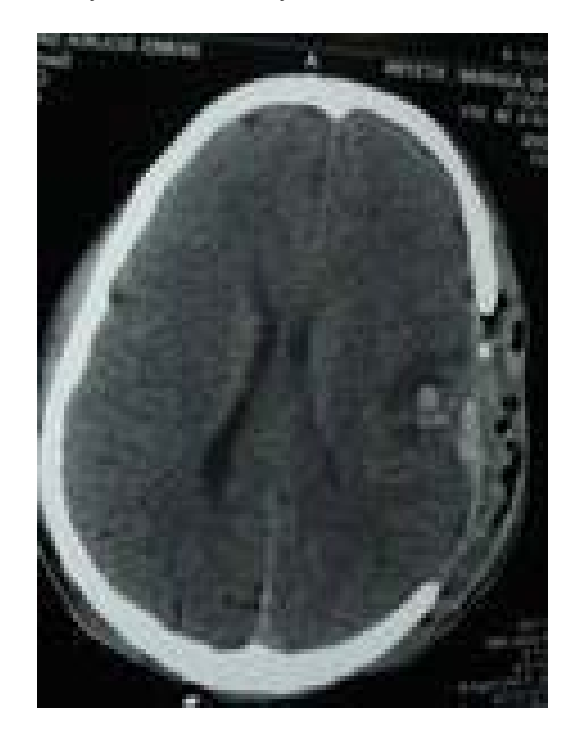
Figure 5: Plain CT Scan brain on the 9<sup>th</sup> post dural-stab day shows relaxed brain and resolving contusions.

GCS of only 5-6 (Table 1). While comparing outcome to the age and sex, the dural-stab (case study group) had an overall and better survival of 78.3% (47/60) and a good-recovery of 43.3% (26/60) especially 30% (18/60) good recovery in the age group 21-40 yrs. This proved effective as compared to an overall 40% (24/60) survival and 11.6% (7/60) good recovery in the open dural flap (contr-trol group) while age group of 21-40 yrs also showed a