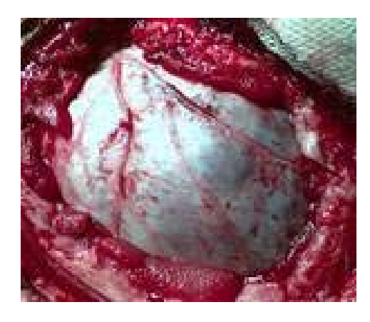
Figure 2: Bulging, bluish and tense dura overlying acute subdural hematoma with severe brain edema after wide craniotomy.