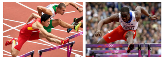
Figure 1. Men's 110 meter hurdles.

In all hurdles, the performance and level of our men's 110-meter hurdles are very prominent. Figure 1 is the men's 110-meter hurdles. Liu Xiang won the 110 meter hurdles in the Athens Olympic Games, which represents the leap development of the men's 110 meter hurdles [3].