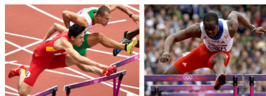
Figure 1. Men's 110 meter hurdles.

In all hurdles, the performance and level of our men's 110-meter hurdles are very prominent. Figure 1 is the men's 110-meter hurdles. Liu Xiang won the 110 meter hurdles in the Athens Olympic Games, which represents the leap development of the men's 110 meter hurdles [3].